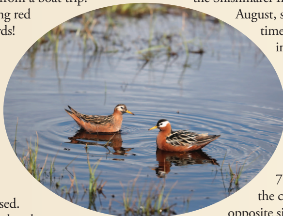
Pair of red phalaropes in Barrow, Alaska, in June – the female is on the right.