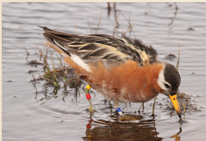
Tagged female “blue-white red” while foraging in a shallow pond. The yellow band on the upper right leg indicates the year. Note the thin antenna sticking up from the back.