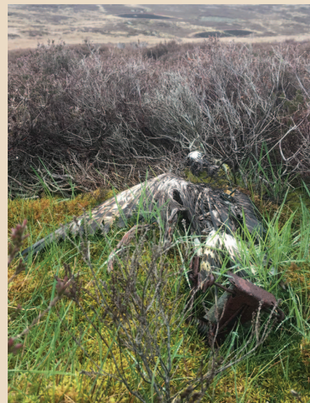
Rannoch found caught in a spring trap.

With the population so low, we are absolutely devastated whenever a bird is a victim of a crime. Satellite tagging has revealed the amazing journeys made by hen harriers but also uncovers how their journeys end. The project is nearing its 5-year conclusion and the data analysis is just beginning.