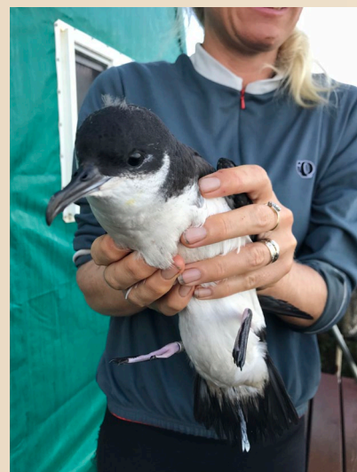
A Newell's Shearwater chick at Upper Limahuli Preserve.

We are now finishing up our study, with the last cohort of birds currently flying away from Kaua'i and out over the deep blue sea. Once they have finished transmitting we will have all of the data we need to see how well the rehabilitated birds fare compared to their wild fledging counterparts, so more to come on this soon! The tracking work has also allowed us to get a better understanding of the first few months of the bird's lives at sea, revealing key areas for newly fledged birds. It turns out that our birds head away from the Hawaiian islands to an area of sea 2500 km away which is (hopefully) rich in squid and flying fish (see map below). The next stage of their life currently remains a mystery, but five years later they will return to our island to find a mate and start digging their own burrows. We will continue to work hard to make sure their island home is safe for their return.