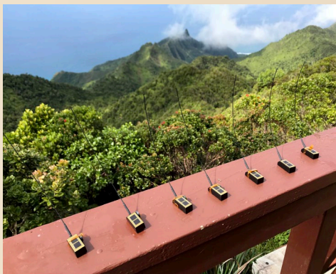
This year's satellite tags, ready for deployment in Upper Limahuli Preserve.

In the mist-shrouded mountains of Kaua'i, the Newell's Shearwater Puffinus newelli still manages to cling to existence. An endangered shearwater endemic to the Hawaiian islands, the species has suffered dramatic historical declines, with populations crashing by 94% in recent decades. The reasons are manifold, including powerline collisions, the ravages of introduced predators such as feral cats and light attraction. Light attraction is a particularly important threat. The shearwater