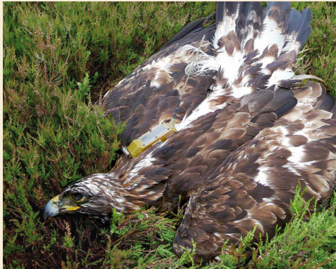
As well as many suspicious tag fates, a handful of illegally killed tagged birds were recovered. This bird had been poisoned.

A simple cluster analysis revealed that final fixes from most 'stop-no-malfunction' tags were usually clustered. More sophisticated distance-based analyses randomly sampled 'virtual final fixes' and showed that 'suspicious' (mostly 'stop-no-malfunction') end points were closely associated at several spatial scales and significantly different to random expectations. Moreover, and importantly, repeating this analysis with the final fixes of 'non-suspicious' tags (e.g., natural deaths, dropped tags, failed tags, still-transmitting) found no difference from random expectations.