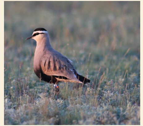
Adult male Sociable Lapwing on the breeding grounds equipped with 5g Solar PTT.

Satellite tracking also shed light on the migration ecology of the species: tracked birds were little site-faithful on the breeding range and would return to areas up to 600 km apart