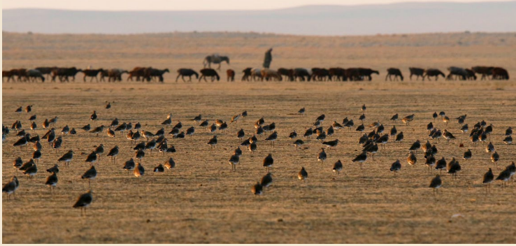
Large flock of Sociable Lapwings at stopover site in Turkmenistan.

The Sociable Lapwing ( Vanellus gregarius ) is a shorebird that breeds across the vast steppe grasslands of Eurasia. A range contraction and a precipitous and accelerating population decline were observed during the 1990s. This led to a reclassification of the species as Critically Endangered on the global IUCN red list in 2004. As the main threats were thought to occur on the breeding grounds, a research and conservation project was initiated in a remaining stronghold in Kazakhstan in 2004. Teams of the Royal Society for the Protection of Birds (RSPB) and ACBK, Kazakhstan's BirdLife partner, have since monitored the survival of the population. However, it turned out that nest and chick survival were sufficiently high to maintain a stable population. The main habitat of the species, heavily grazed steppe swards created by domestic livestock, had declined in extent, but there were no indications that habitat availability was a limiting factor.