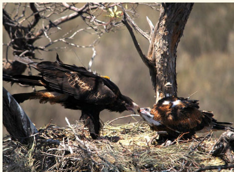
Gidjee feeds Kuyurnpa a freshly killed rabbit. Both eagles have solar PTTs attached to their backs.

In late 2011, I began researching Wedge-tailed Eagle ecology at Lorna Glen, a conservation reserve in the middle of WA. This study site provided an ideal location to track birds, especially because detailed information on habitat use in relation to reintroduced threatened mammal populations was part of the research.