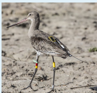
Released black-tailed godwit in Spain.

The tracking of several species and populations of godwits and knots by the Global Flyway Network consortium over the last eight years, rather than to describe their migratory movements (which are generally well-known), serves to pin-down any bottlenecks in annual cycles. We relate the use of sites with subsequent performance (i.e., timing of migration, breeding success, survival, and physical state based on visual observations). This approach is illustrated by our study on black-tailed godwits tracked during the last leg of their northward migration between the nonbreeding area in West Africa and the Dutch meadows where they breed in two contrasting springs: one of the coldest on