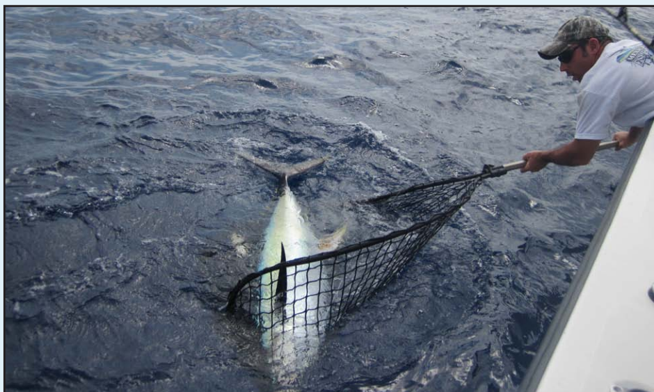
Yellowfin tuna being netted in preparation for MTI X-Tag attachment.