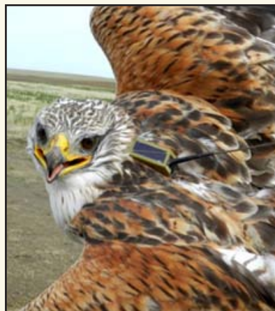
Adult male Ferruginous Hawk 118208 (left) with Argos/GPS PTT in 2012 and his home range (right).

inbox on a daily basis. The transmitters will attempt to transmit data 3 times each day and if the bird is within GSM range the user will receive an email with the most recent data within minutes. If you're like me, you look forward to checking each of those emails to see where your bird has spent the past day, and to get instant information in case of mortality.