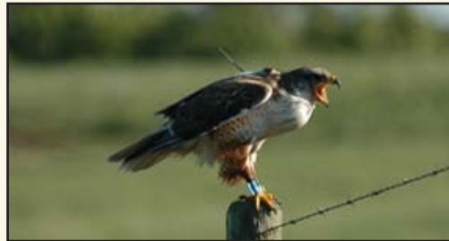
Adult male Ferruginous Hawk 203 with his GSM/GPS transmitter in 2013.

Although, initially my biggest concern was deploying GSM/GPS units in dead zones, 24 out of my 29 hawks nested in areas where GSM coverage was consistent. Of the 5 hawks in dead zones, 4 had their first transmission once migration began (~2 months after deployment) and each transmitter backfilled their entire summer's dataset...let me tell you, receiving those emails was like an early Christmas! The increased volume of data provided by GSM/GPS transmitters is striking. Throughout one breeding season (April 1 - Sept 20), one breeding male transmitted just shy of 80,000 locations in comparison to another hawk wearing an Argos/GPS unit which has transmitted around 3,000 locations throughout the same duration. I am just