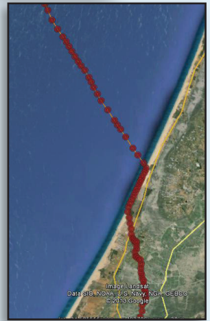
Blue XD arriving on coast of northern Morocco 1113 GMT on 13 September 2013.

We now realise that it's essential for osprey conservation that ever-better links are established between the people of Europe and Africa. The satellite tracking data reveal the dangers of migration, the important stop-over locations, how they cross the ocean and the desert, where they winter, and how young ospreys learn to survive in Africa. The excitement of the satellite data has proved to be one of the most successful ways of bringing us together, especially when linking schools together over the whole migration route. ( www.ospreys.org.uk/osprey-flyways-project/ ). The new GPS/GSM trackers will bring that into even sharper focus.