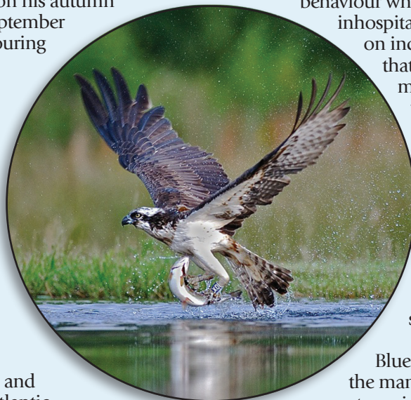
Blue XD fishing at Rothiemurchus Fishery, Scottish Highlands.

Blue XD is a male osprey breeding not far from Loch Garten, the osprey mecca in the Highlands of Scotland. He is a bird I know well, having ringed him as a sub-adult in 2000. His mate is 22 years old and winters in central Spain. After feeding his young through post-fledging, he set off on his autumn migration at 0730 GMT on 10 September and the migration data started pouring in, often at one-minute intervals – GPS location, heading, speed, and altitude. He flew through Scotland and England, over the sea to France and then 475 km over the Bay of Biscay. He did not stop on the North Spanish coast but headed on until he settled for the night near Plasencia in Extremadura – 2025 km in one flight of 35 hours and 10 minutes, at an average speed of 57.6 km/h.