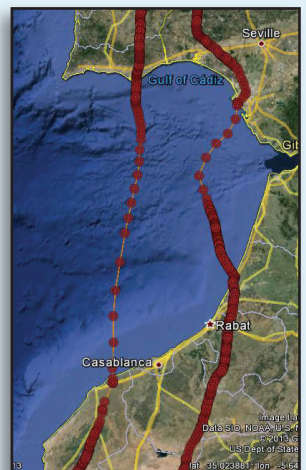
Migration routes of two male ospreys crossing from Europe to Africa.