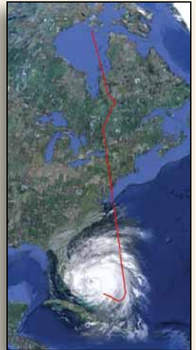
Track of Chinquapin through Hurricane Irene.

The autumn migration season of 2011 provided new lines of investigation, including the response of migrating Whimbrels to large storm events. We had been tracking a Whimbrel known as Hope since May 2009. During her third fall migration we tracked her as she flew into the heart of a tropical storm off the coast of Nova Scotia. She averaged 14km/hr for 27 hours flying through the storm before finding tailwinds that pushed her to landfall at a rate of 147km/hr! The next Whimbrel that encountered a storm event occurred when Chinquapin began his fall migration from Coates Island, Nunavut, Canada and made way over the Atlantic Ocean. He flew 5100km in 5 days before encountering category 3 Hurricane Irene. The duty cycle on this bird's PTT was 48hrs off/10hrs on. So, when we received the last data point when Chinquapin was in the eye of the hurricane, we had to wait a full 48 hours to determine if he had successfully navigated the storm. We were relieved to find the bird alive on an island in the Bahamas after the two day wait.