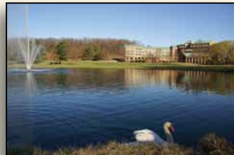
We will again host our conference at the Turf Valley Resort and Spa in Ellicott City, Maryland.

Our conference in March 2009 was such a success, despite the grim economy, that we are frequently asked when we will host another conference. We have provisionally set aside September 27 to 29, 2011 for our next 3-day Bird and Fish Conference. The conference will include scientific papers, speakers, and workshops relating to bird and fish tracking and new products. If you would be interested in attending or presenting at this conference please contact us by March 2011. We will post more information in the next issue of Tracker News.