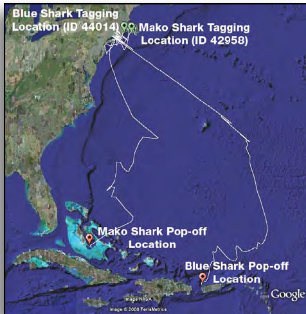
Tagging and pop off loctions of blue shark and short fin mako shark released in the fall of 2007.

through the thermocline when on the continental shelf. We also gathered important long-term migratory data, as we found that male blue sharks leave the continental shelf moving in a southeasterly direction in the fall following a general southern heading to warmer Caribbean waters and apparently return north to the New England continental shelf early the next summer. We have continued our tagging efforts in the summer of 2008, with six more, long-term duration tags (6-12 month scheduled pop-offs) deployed on male blue sharks and one on a shortfin mako, and are hopeful for a successful 12-month reporting tag!