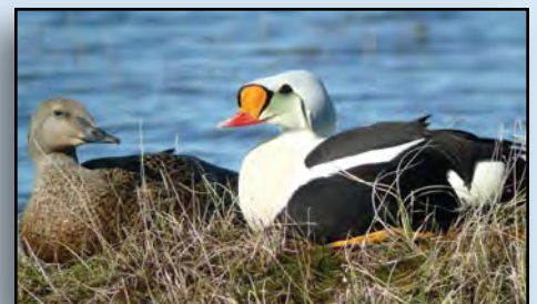
King Eider pair on breeding grounds in Alaska.

The eastern Chukchi Sea is especially important during spring migration. The area between Point Barrow and Point Thompson along the Alaskan coast is used by every single King Eider migrating to breeding grounds in western North America. Even more surprising, some King Eiders migrating to Siberia fly a detour of several hundred kilometers to forage in the eastern Chukchi Sea during spring migration. From the results of our satellite tracked birds we estimate that more than half a million eiders congregate in the eastern Chukchi Sea in May each year. The eider staging area is very close to areas currently explored for offshore oil development, and an accidental oil spill in this region could have catastrophic consequences for eiders.