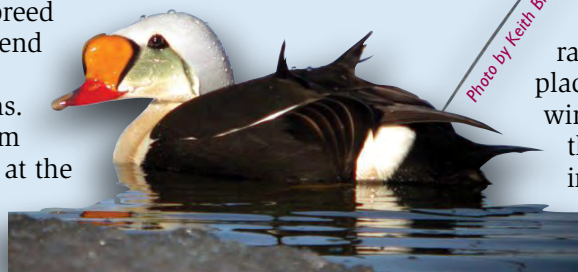
Male King Eider with implanted satellite transmitter.

King Eiders ( Somateria spectabilis ) are sea ducks that breed in the Arctic and spend most of the year in cold northern oceans. They dive up to 60 m deep to gather food at the bottom of the sea. Because of their marine lifestyle it has been very challenging to track