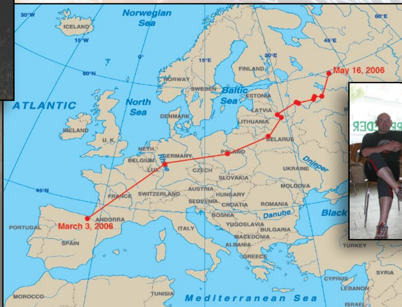
This map shows Trasgu's journey from its launching site in Etxarri-Aranatz, Navarre, Spain to potential nesting grounds in Russia.