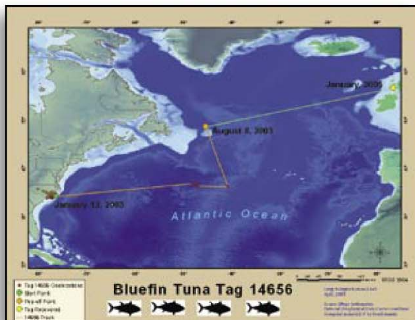
Route of the Bluefin Tuna Tag 14656— North Carolina to Scotland

was special. The discovery of this tag created a lovely link joining the curious schoolchildren on Coll, the crew of the Striker, and my graduate students and I, uniting us in our shared interest in and abiding love of the sea and the magnificent creatures that swim past our shores.