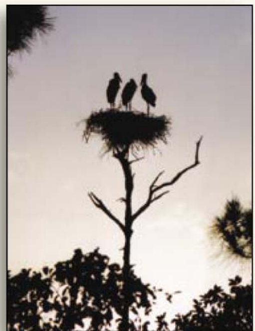
Young Jabirus in nest atop pine snag.

In recent years the Mesoamerican region has experienced an unprecedented rate of habitat loss, fueled primarily by the associated explosive human growth rate, ever-increasing commercial exploitation of natural resources, and accelerating tourism development. Critical habitats and unique elements of the region's flora and fauna are being degraded and lost at an alarming rate. The future of many species and their habitats now depends on our ability to provide timely recommendations to key decision-making organizations. The types of data produced by satellite/GPS telemetry provide the best information for planning the conservation of the regionally endangered Jabiru stork and a host of other threatened sympatric species. This technology now makes it feasible not only to collect the necessary data, but to do so rapidly before the window of opportunity closes.