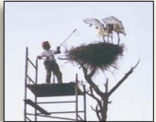
Marcus Cakul capturing Jabiru nestling.

three of the tagged birds were from nests that lay within protected areas. In short, nesting adults and juvenile storks all strongly selected specific habitats that occur mainly outside of publicly-owned protected areas. These habitats, furthermore, represent a very small portion of the total area of Belize and lie primarily within the region targeted by long-range government planning for the most rapid and intensive growth in the country.