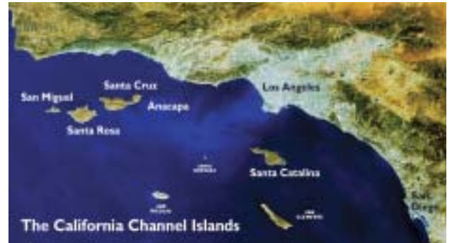
Fig.1: The Channel Islands, CA were the focus of the bald eagle reintroduction project.

There were several questions we had regarding reintroducing bald eagles on Santa Cruz Island. First, Santa Cruz Island is one of four islands (San Miguel, Santa Rosa, Santa Cruz, Anacapa) in a chain of islands that are about 5-10 km apart and cover a linear distance of approximately 100 km. We wanted to know whether it would be possible to restore eagles to all four islands using only the release sites on Santa Cruz Island. To answer this we would need to closely monitor the eagles' movements to determine whether they moved between the islands. The second question was whether released bald eagles would negatively impact several species of nesting seabirds that are found on the islands. Finally, our previous experience has shown that a portion of the released birds often migrate to the mainland, sometimes returning to breed in the future. We wanted to be able to closely follow the birds' movements both on the