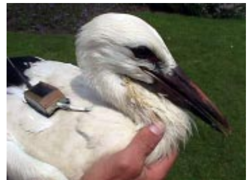
Oriental White Stork fitted with a 35 gram solar PTT