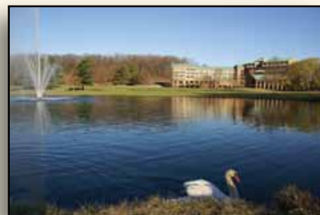
We will again host our conference at the Turf Valley Resort and Spa in Ellicott City, Maryland.

Our conference in March 2009 was such a success, despite the grim economy, that we are frequently asked when we will host another conference. We have provisionally set aside September 27 to 29, 2011 for our next 3-day Bird and Fish Conference. The conference will include scientific papers, speakers, and workshops relating to bird and fish tracking and new products. If you would be interested in attending or presenting at this conference please contact us by March 2011. We will post more information in the next issue of Tracker News.