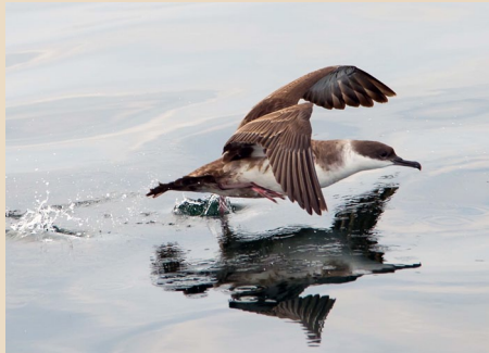
Great shearwater.

The great shearwater (GS) is a numerous, long-lived species of seabird that breeds in the South Atlantic's remote Tristan da Cunha Island group and spends the austral winter foraging throughout the western North Atlantic, including the Gulf of Maine (see figure). While the general annual migration pattern of the birds is well known, little fine-scale information exists relative to habitat use and interaction with human activities. This is a management concern for the U.S. Fish & Wildlife Service and U.S. National Marine Fisheries Service, since GS are subject to high levels of bycatch in commercial fisheries, at least in the northern parts of its range.