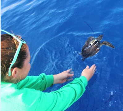
Releasing a green turtle with a Solar 9.5g Argos PTT.

green ( Chelonia mydas ), hawksbill ( Eretmochelys imbricata ), and loggerhead ( Caretta caretta ), all of which are protected by the U.S. Endangered Species Act and listed as vulnerable to critically endangered by the IUCN.