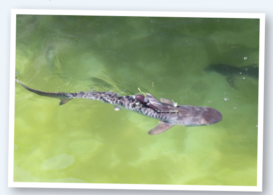
Juvenile tiger shark tagged with an X-Tag in southeastern Taiwan.