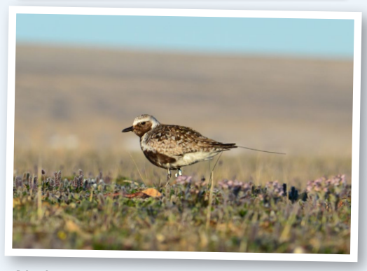
Black-bellied plover fitted with a 5g Solar PTT at the Polar Bear Pass National Wildlife Area in Nunavut, Canada.