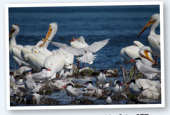
Caspian tern fitted with a 12g Solar PTT near Irrigon, OR.