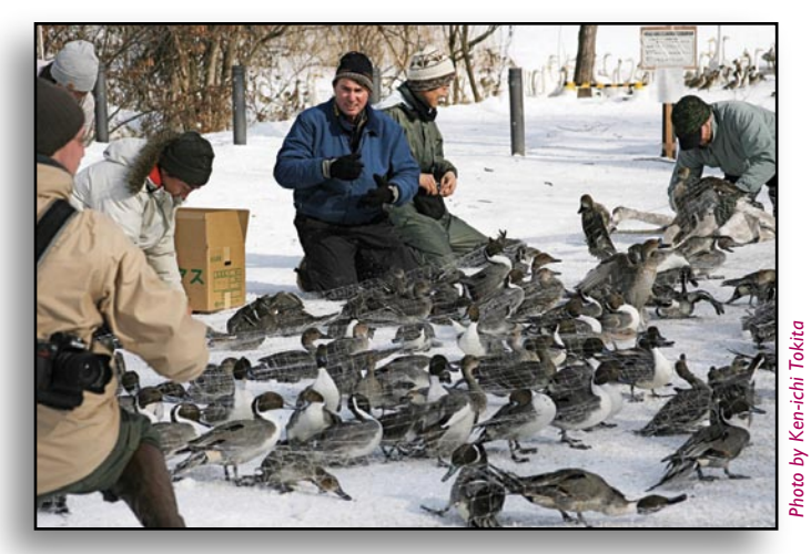
USGS and Japanese scientists are removing pintails captured by a clap net in northern Honshu, Japan.

Our research results have led to conservation outcomes in many East Asian countries, including the establishment of national nature reserves (about 3,000 ha in Mundok and 2,000 ha in Kumya) for migrating cranes in North Korea and of a 5,200 ha nature park for breeding cranes and storks in Muraviovka, southeastern Russia. Based on the results of the crane satellite tracking data, aerial surveys and satellite images, we recommended massive changes to the existing development plans in Three Rivers Plain in northeastern China, and some of the recommendations have actually been implemented. All these contributions are due to active international collaboration among scientists and conservationists.