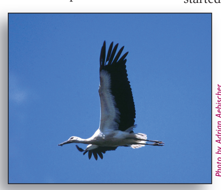
Max on one of her first flights after fledging at

In August 2000 Max flew again to Morocco, tried to cross the Sahara but returned to northern Morocco to spend her second winter there. Next spring she flew to Central Europe and visited a village called Salem in southern Germany, but she did not breed. In late summer she again migrated to Morocoo returning to Salem in summer 2002.