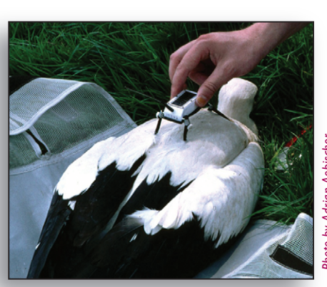
Max being fitted with a 35g Solar PTT.

attached as a backpack to Max. It was decided that her journeys should be docmented and mapped for everybody to follow on the Internet.