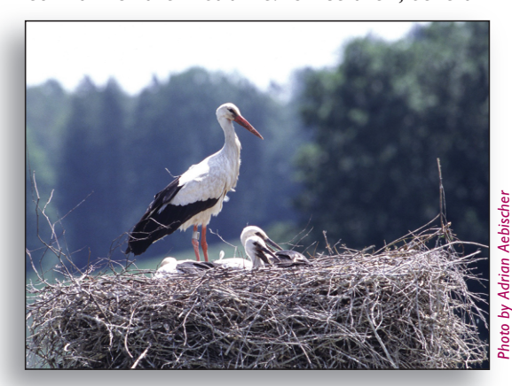
In 2004 Max reared three young

in Europe reported on this bird. A Swiss TV team was present when she was fitted with this PTT, and filmed Max for the first time. Since then, several TV